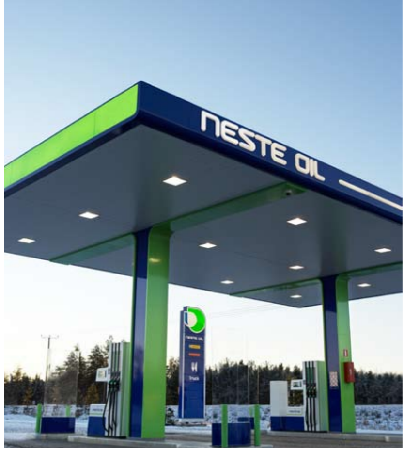
An average Neste Oil petrol station that uses Aura's Eco Solution for outdoor signage receives a ten year maintenance-free light plus a solution that is fully protected against humidity, corrosion and humidity.